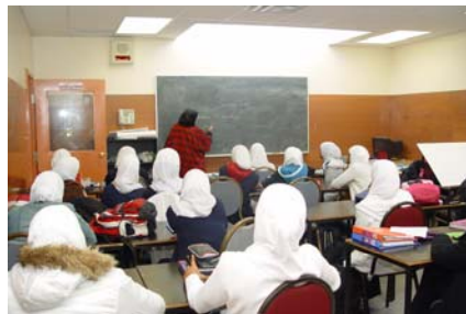
CLASSROOM (SECOND FLOOR)