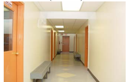
SECOND FLOOR HALLWAY