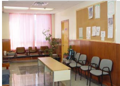
MAIN FLOOR FOYER (OFFICE AREA)