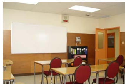
CLASSROOM (SECOND FLOOR)