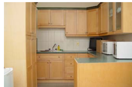
STAFF LOUNGE KITCHEN (SECOND FLOOR)