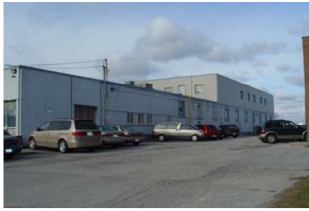
SCHOOL VIEW FROM THE SIDE